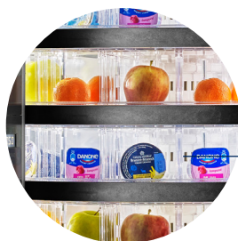
Variable temperature options