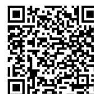
Energy Label Available with this QR code