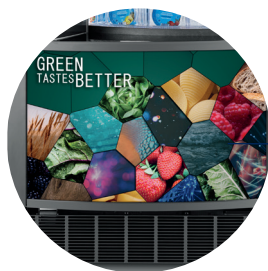
A simple design for a true automatic canteen