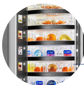
Flexible snack, food and drinks offer